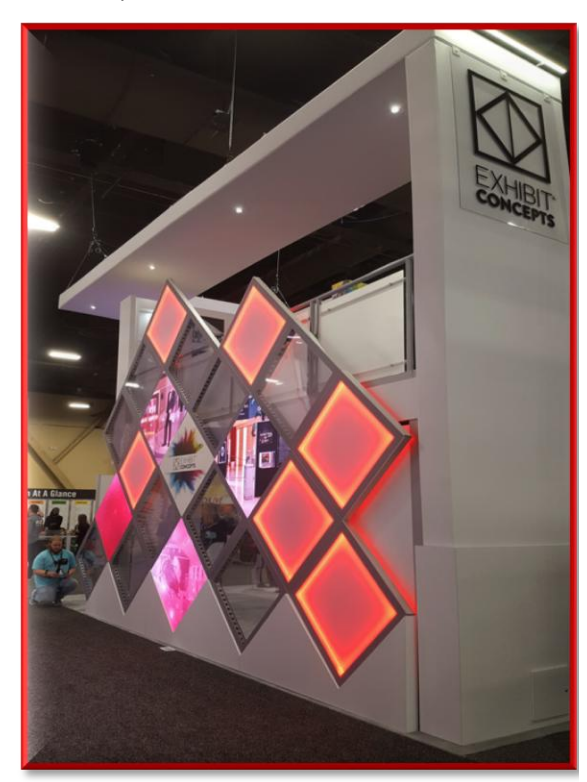
▲ Exhibitor Live 2018 ■ ECI ■ BEST of SHOW Pro-Player Plus controlled the whole monitor array in this award winning 20x30 Exhibit Concepts booth.

For trade shows and installations, Pro-Player Plus™ is the most flexible control and playback system available.