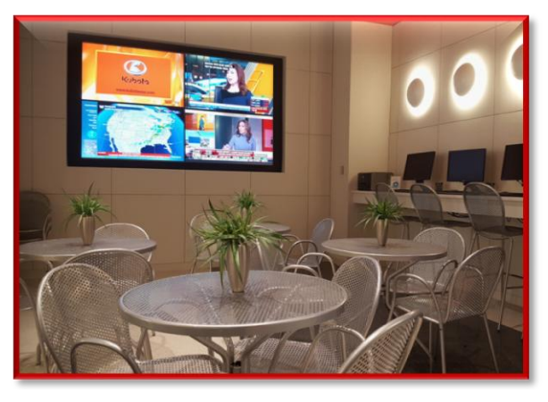
▲ Eaton Industries Cyber Cafe Installation Pro-Player Plus solved the customer's need for a cost-effective way to display 8 unique content sources. on a 2x2 monitor array

For trade shows and installations, Pro-Player Plus™ is the most flexible control and playback system available.