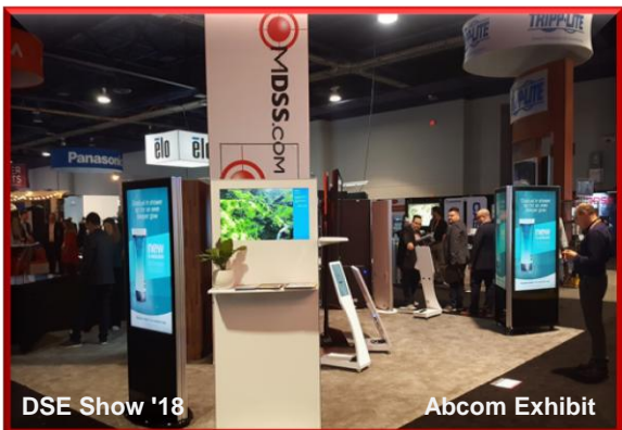
DSE Show '18 Abcom Exhibit