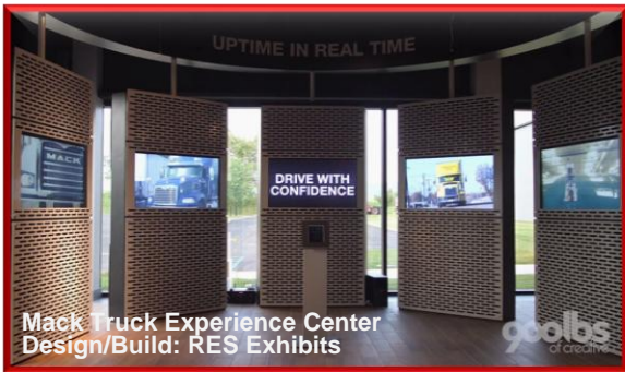
Mack Truck Experience Center Design/Build: RES Exhibits